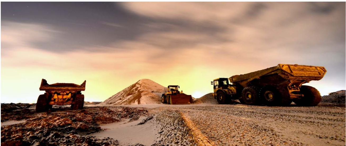
MSW Project (P&D) Jhiri, Ranchi (Jharkhand)